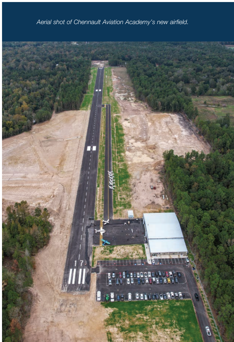
Aerial shot of Chennault Aviation Academy's new airfield.

This article first appeared on GlobalAir.com on Thursday, November 16, 2023. https://www.globalair.com/articles/chennault-aviation-academy-opens-new-airfield-in-texas?id=6628