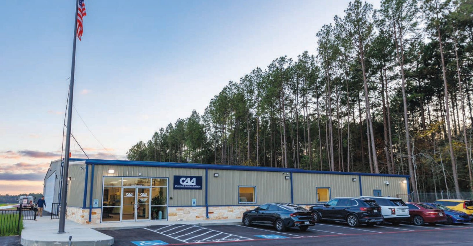
The Chennault Aviation Academy's newly built office building.