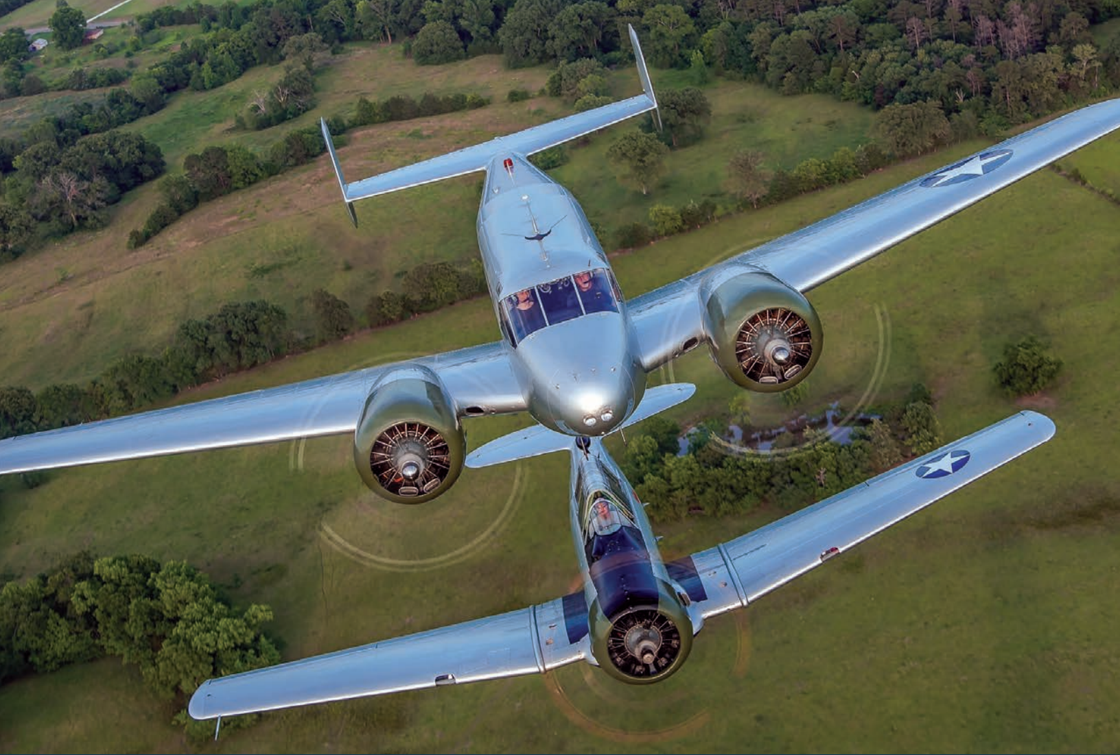
AT6, Beech 18 Formation.