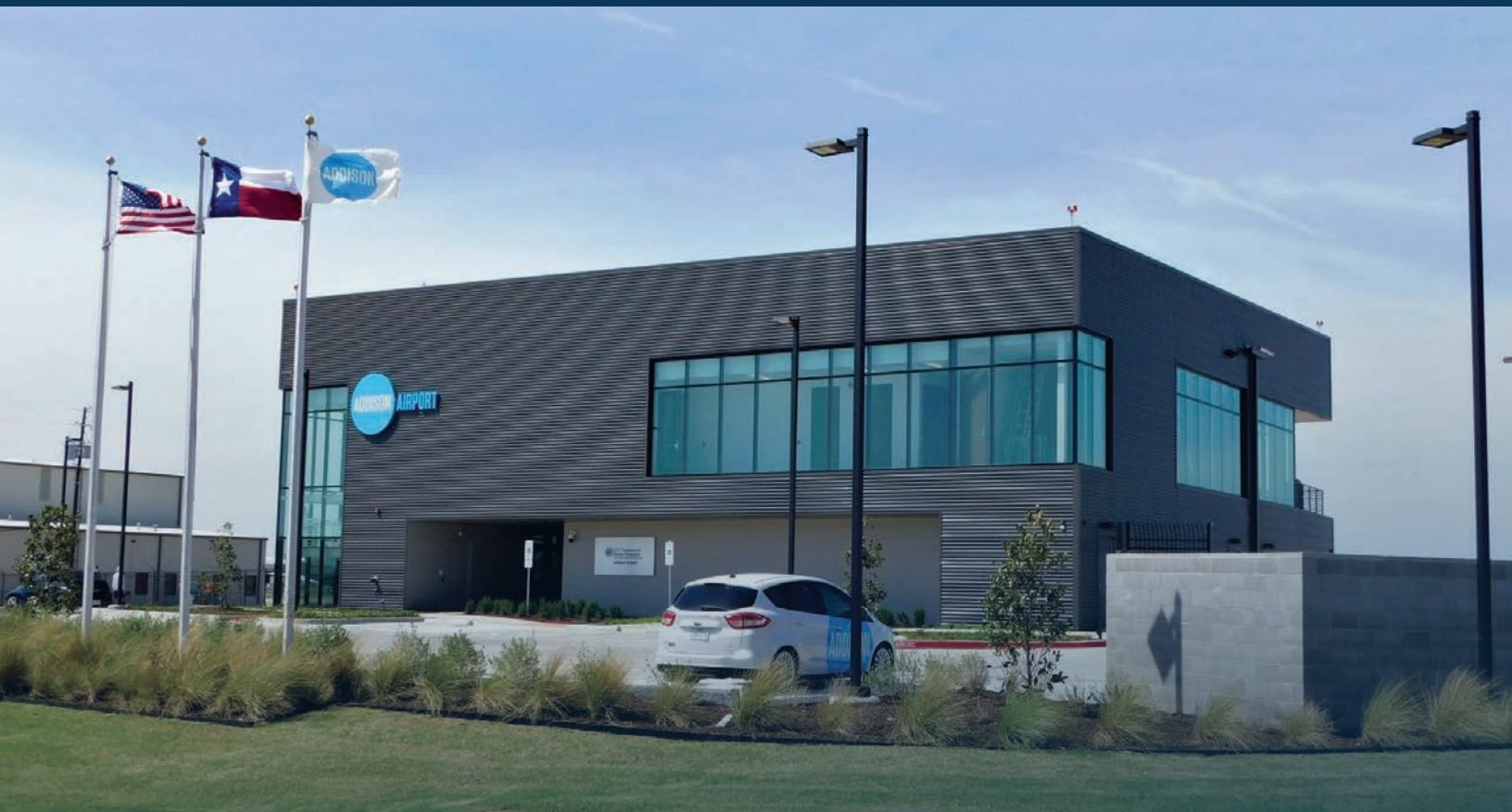
Addison Airport's new U.S. Customs & Border Protection and Airport Administration building, as viewed from the landside, on the day of its formal grand opening, April 19, 2022.