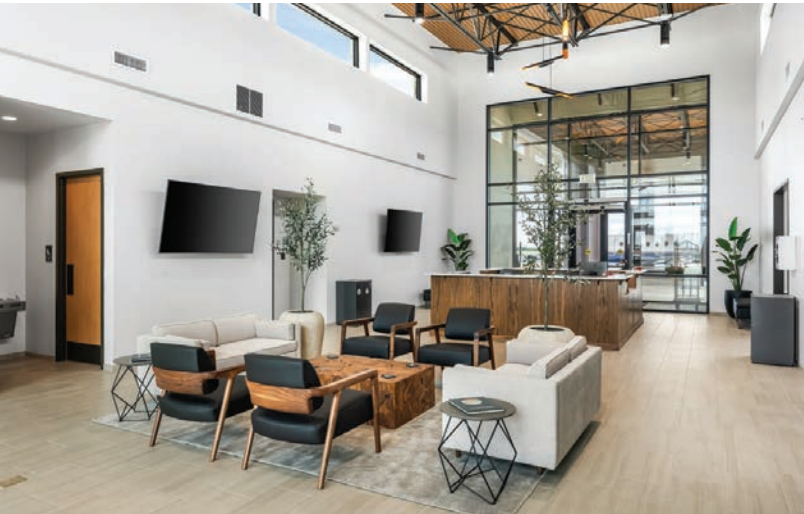
Main FBO Lobby complete with front desk reception and passenger/crew amenities.

This article first appeared on GlobalAir.com on Monday, October 30, 2023. https://www.globalair.com/articles/central-texas-airport-to-celebrate-grand-opening-of-new-fbo-facility?id=6568