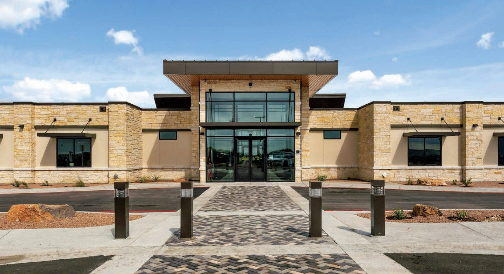
City of Temple, Texas Airport terminal serving both as the Draughon-Miller Central Texas Regional Airport administrative offices and Fixed Base Operation, the Temple Executive Air Center.