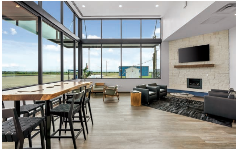
Luxurious passenger lounge complete with brand new furniture, dining and lounging areas, fireplace, and TVs.

Aircraft awning to fit up to a Global Express. Serving the fastest quick turn in the country while customers stay out of the elements.