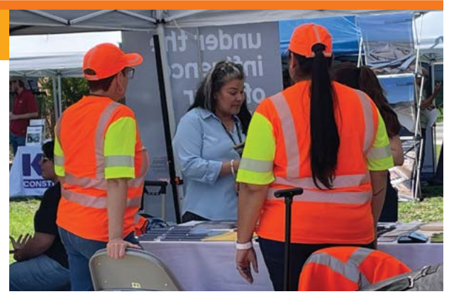
The Austin District recently hosted the "I Built This" Workforce Rangers Job Fair.

Workfa Workfa Workfa Workfa Workfa Austin "Our district team and our industry partners have provided great platform to showcase the diverse opportunities our industry has