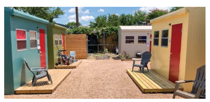
TxDOT recently acquired an additional seven acres adjacent to Esperanza Community, a non-congregate emergency shelter complex in the Austin District.

The foundation's mission is to transition Austin's homeless population into a productive community through shelter, opportunity and support. Programs