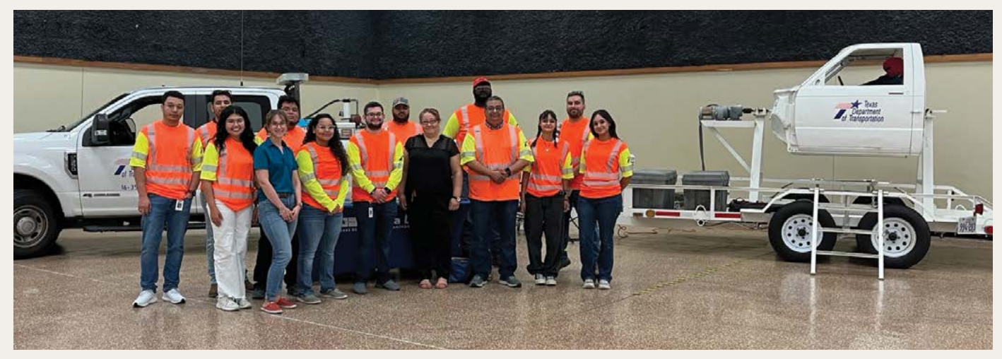
Corpus Christi District staff and volunteers at a safety event last year pose with the Rollover Convincer, a way to help kids, teens and parents understand the importance of using safety belts.

he Corpus Christi District recently launched an initiative to bring TxDOT's strong safety culture to all aspects of life.