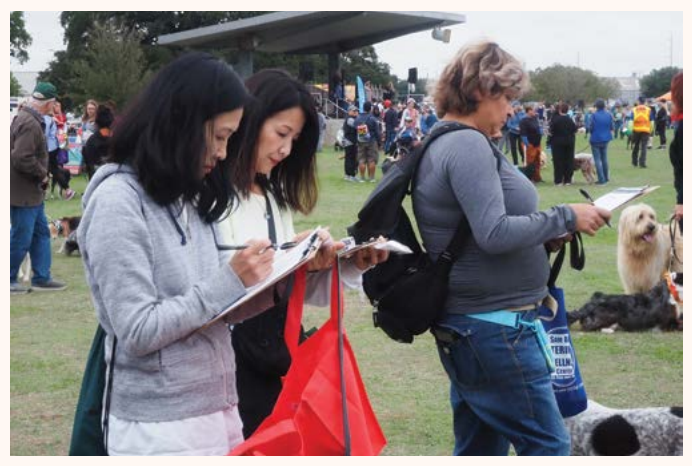
Last fall, the Statewide Active Transportation Plan team attended the Mighty Texas Dog Walk to get feedback from the public about their priorities.

Under the umbrella of its Statewide Active Transportation Plan, the division is expected to deliver a series of recommendations by year's end to ensure Texans and Texas can keep pace with the state's growth and keep people and business moving.