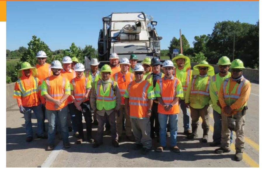
The Houston District won a 2023 Quality in Construction Award for the work of the Fort Bend/Waller Area Office design team and contractors Durwood Greene Construction Co. and American Materials Inc.

The project was designed by the Fort Bend/ Waller Area Office design team. The project was also selected for the 2023 TxDOT/TXAPA Quality Asphalt Pavement Award in the Specialty Mixes Division Category. ■