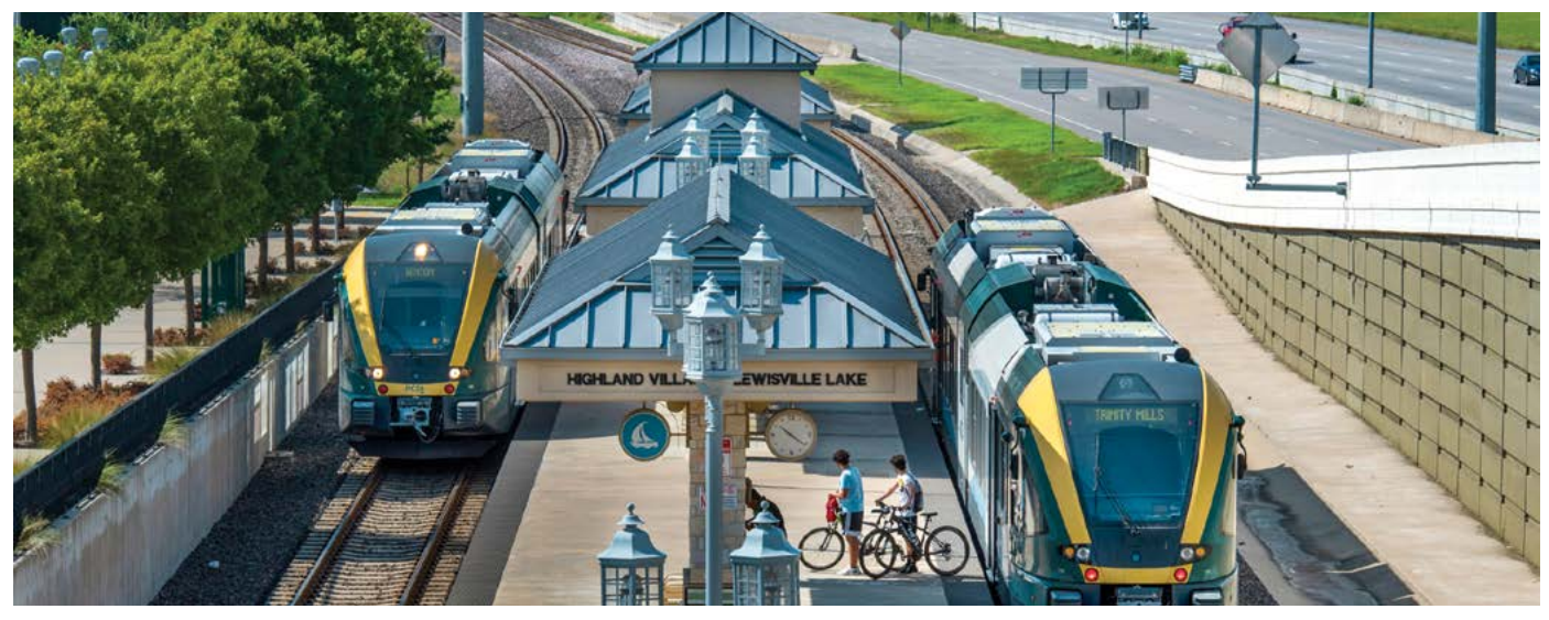
TxDOT is developing a Statewide Multimodal Transportation Plan to identify the needs for transit options like this commuter rail in Denton.

xDOT is currently developing a Statewide Multimodal Transportation Plan to identify strategies for improved mobility and connectivity across Texas.