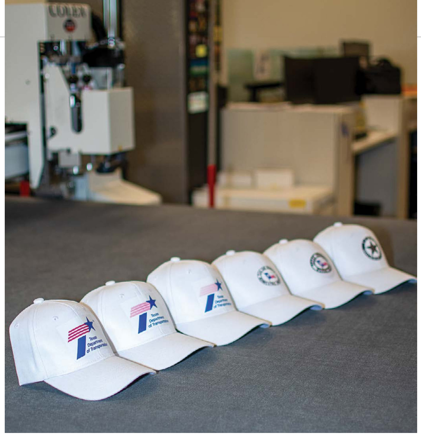
TxDOT's logo and brand continues to evolve.

forward. This is part of a larger vision to strengthen TxDOT's brand and feel on everything we publish — internally and externally. Kudos to Creative Services for their meticulousness."