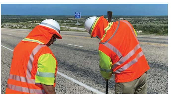
The 2024 Safe Days of Summer campaign runs May 1 to Aug. 29.

Safety tips will be distributed throughout the summer. While the summer months can be challenging for TxDOT employees, with excessive heat and increased road construction and maintenance operations, the Safe Days of Summer campaign reminds everyone to prioritize safety and look out for our co-workers.