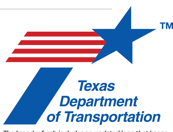
The brand refresh includes an updated logo that keeps the "Flying T" design but has solid red bars instead of 12 separate lines.