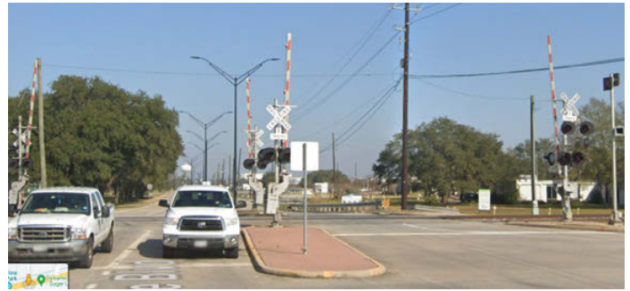
Example of a crossing where the Monitoring System is installed.